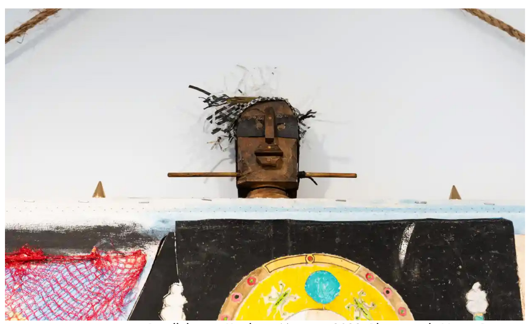
Bundlehouse: Kinshasa Memory, 2023.

But even though the series is strongly rooted in particular forms of historical wrongdoing, for Smith it ultimately transcends particular identities and events to implicate a basic part of the human experience. "Bundlehouse is not just about the structures made of these found materials, it's a wider concept – thinking about what it means to rebuild your life by picking up the pieces again after a traumatic event. Building these structures within the context of a traumatic event or crisis."